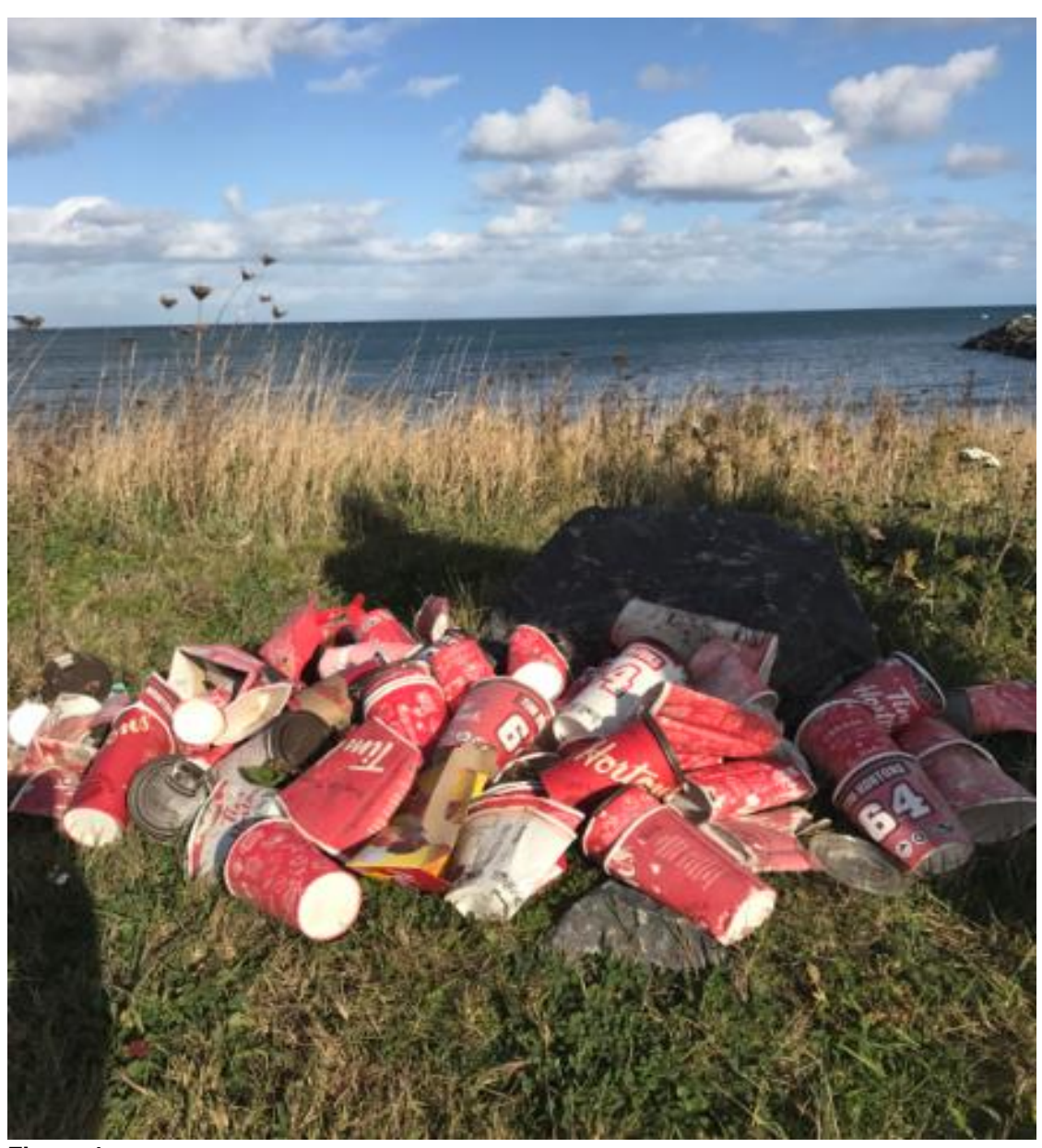
Figure 4 CBEC, Accumulation of Tim Horton's cups during a 1 hour clean up. Fisherman's Park Glace Bay