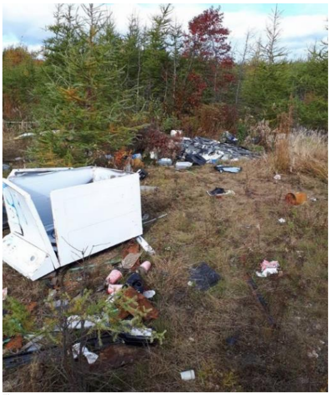
Figure 3 CBEC, Illegal dumpsite, containing motor oil and other toxic chemicals, Number 11, Glace Bay