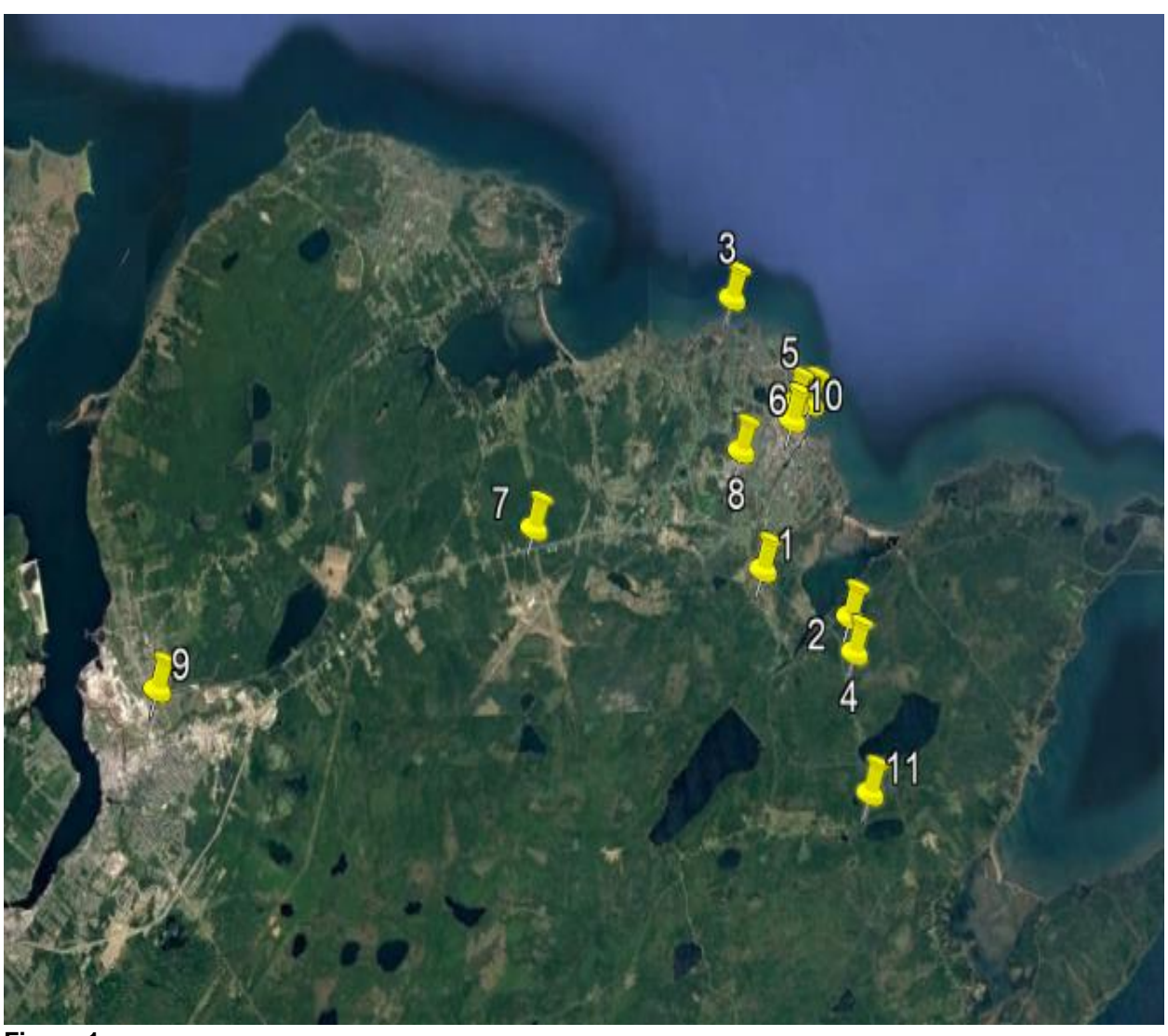
Figure 1 CBEC, Ariel photo showing cleanup sites throughout Sydney, Glace Bay Area. 2017