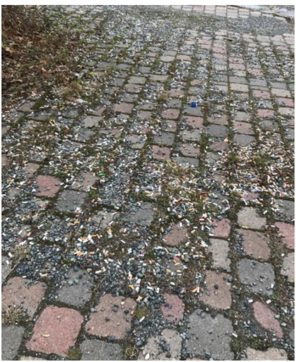
CBEC, Cigarette butt site located next to Tim Horton's, Commercial Street Glace Bay