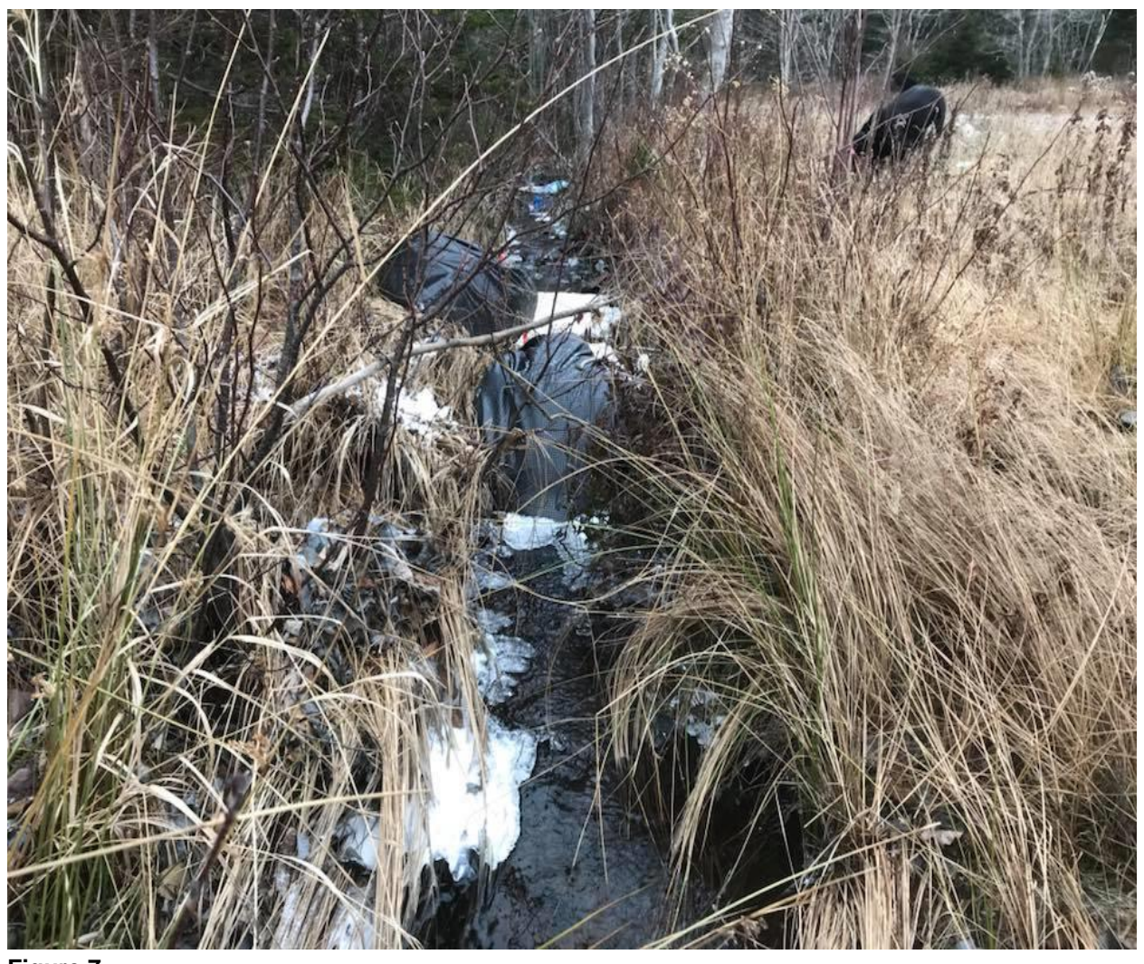
Figure 7 CBEC, Stream Obstruction due to Illegal Dumping, Morrison Lake, Birch Grove NS