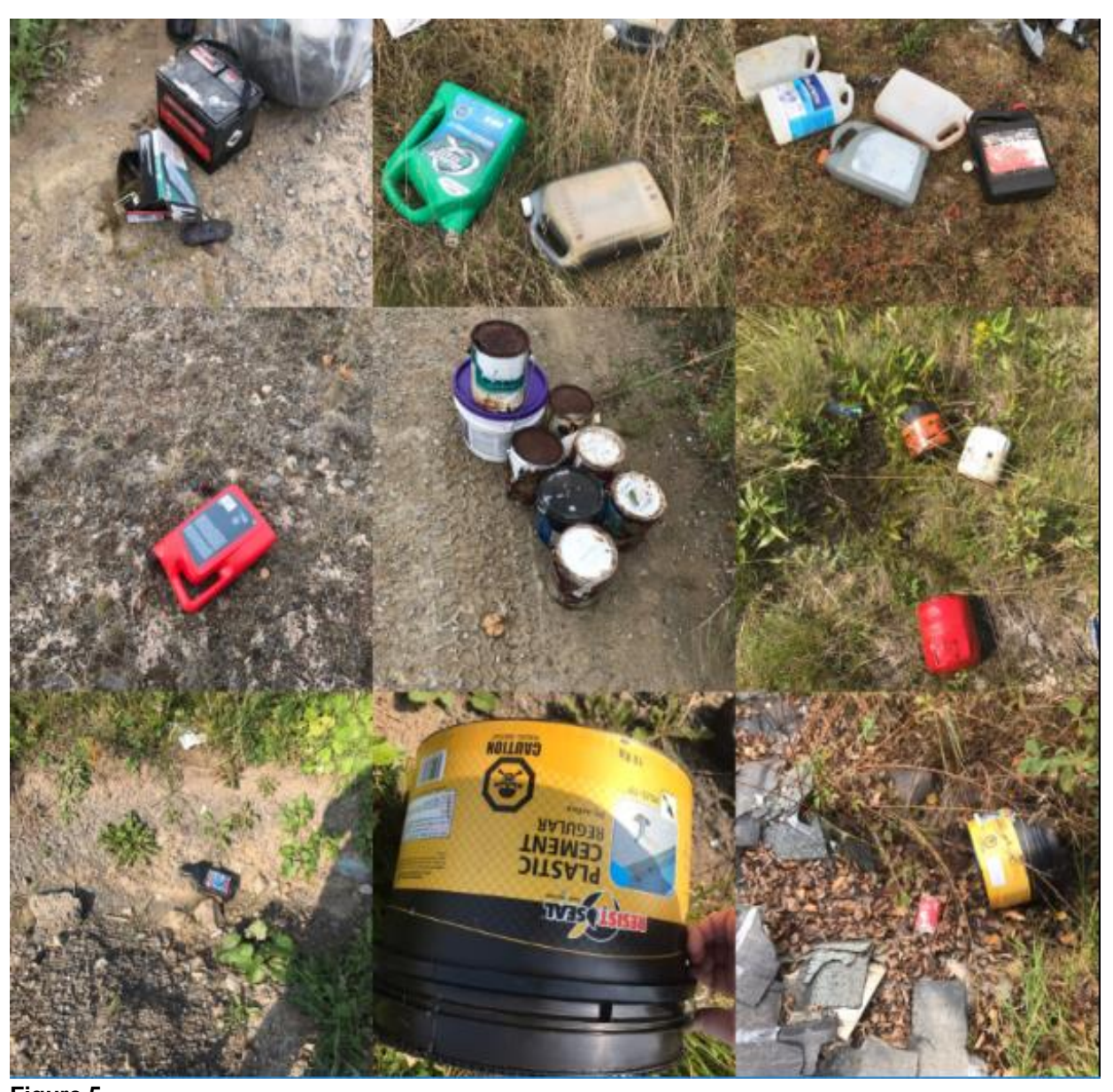
Figure 5 CBEC, Toxic chemicals in various dumpsites throughout the CBRM 2017